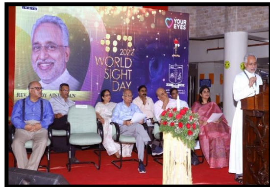
Public meeting at Little Flower Hospital, Angamaly, Kerala