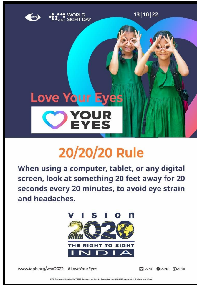
World Sight Day 2022 Poster