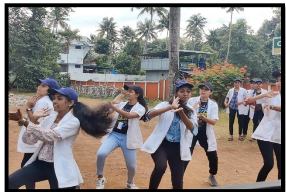
Optometry Student Volunteer performing Eye Health Awareness Message