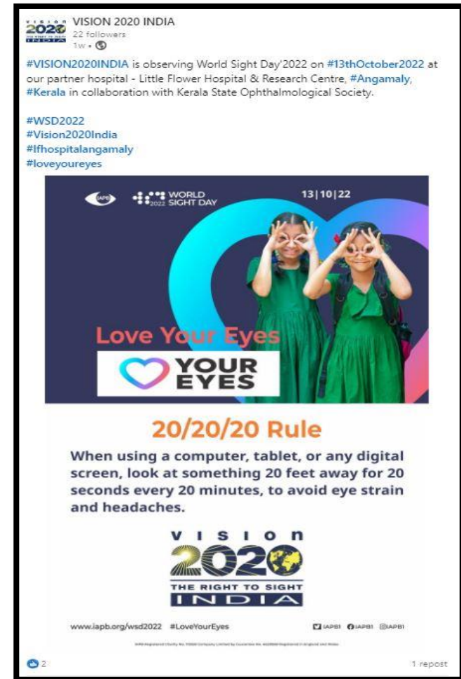
World Sight Day 2022 Activity Launch