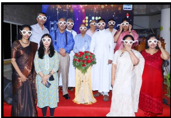
Dignitaries wearing Love Your Eyes Glasses