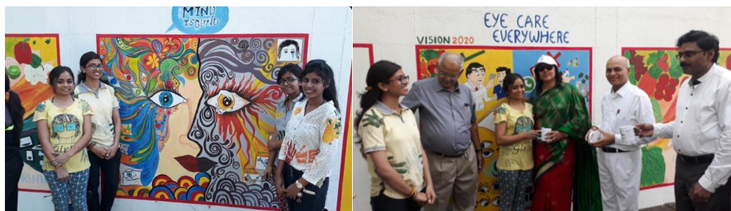
Students completed the wall paintings working at night

formal programme was organised at the premises of Sewa Sadan Eye Hospital to felicitate the awardees of the WSD competitions.