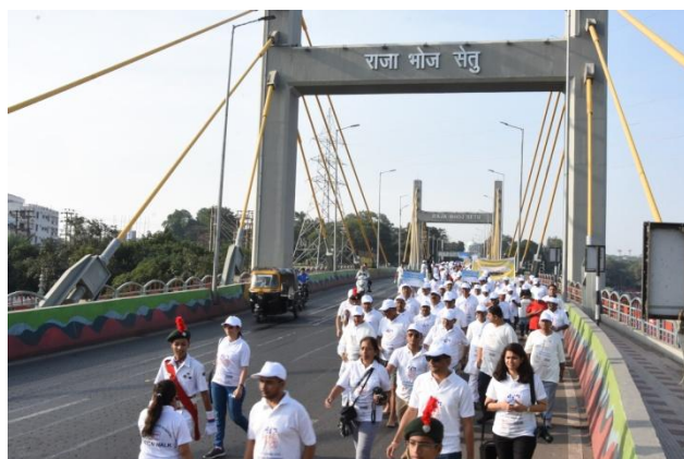
Nearly 600 participated in the WSD walk