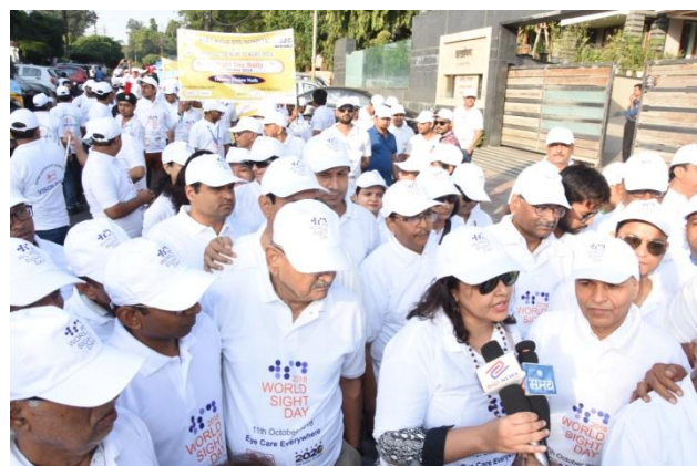
Media coverage of the walk spread the news to larger audience

Deputy Director General, National Programme for Control of Blindness (NPCB), Ministry of Health, Government of India, Dr Sangeeta Abrol flagged off the walk. Nearly 600 participants with placards bearing message promoting eye health walked along the city's lake. Ophthalmologists and students raised slogans on eye care managing to attract the attention of the public.