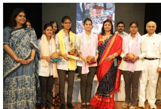
Students being felicitated