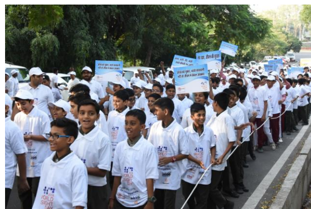
Students at the WSD walk

We thank Sewa Sadan Eye Hospital's entire management for hosting the event and ensuring a grand success.