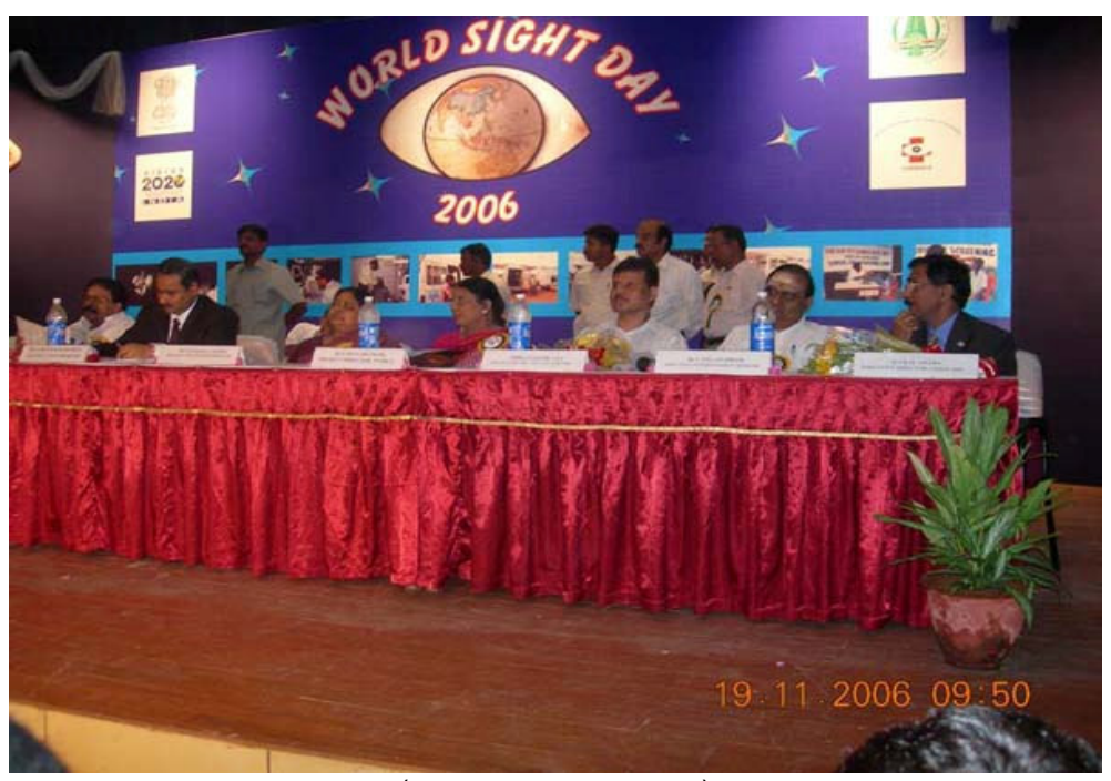
(Dignitaries on the dais)

The final ceremony of the World Sight Day 2006 was organized at IMAGE Auditorium, MRC Nagar in Chennai on 19<sup>th</sup> November 2006 from 7:30 AM to 8:00 AM.. VISION 2020: The Right to Sight – INDIA Department of Ophthalmology, Ministry of Health and Family Welfare of Government of India in association with, Tamilnadu State Blindness Control Society and Tamilnadu State Government celebrated in a big way.