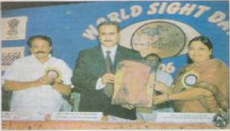
Union seelth Minister Anbumani Ramadoss, Minister of State for Health Fanabaka Laksheri and Tr. Health Minister KKSSR Ramochandran at the world Sight Day celebrations in the city on Sunday

Special training lead set to been given to 1.25 lasts seen. tentifiers had your The Centre sound give special