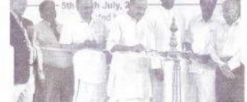
Photo: Minister K. M. Mani inaugurating the national conference of Vision 2020 project at Angamaly Little Flower Hospital on Sunday