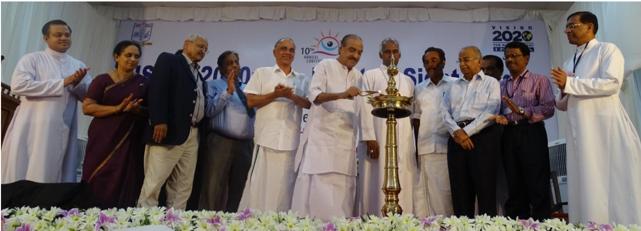
Finance Minister, Kerala, Mr KM Mani lighting the inaugural lamp

Shri K.M. Mani, Honourable Finance Minister, Government of Kerala in his inaugural speech congratulated VISION 2020 – India for holding a first ever such conference in Kerala. The minister appreciated the partnership approach adopted by VISION 2020 at the global and also at the national level. The minister further emphasised that no organisation alone can achieve this task of eliminating avoidable blindness on its own and the success lies in the collaborative effort that should percolate down to all levels.