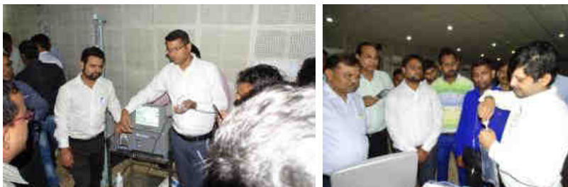
Practical demonstration at the workshop

A training Programme on Equipment Maintenance was conducted on 29 September 2019 at Sitapur Eye Hospital, Sitapur, UP. Forty delegates from 12 organisations from 2 States got benefitted from the event. Our Corporate Advisory Board member, Alcon, conducted the programme.