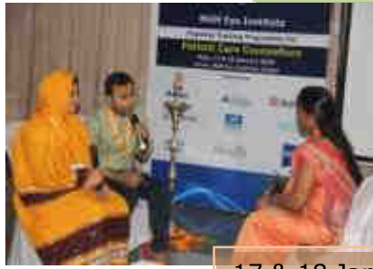
17 & 18 January 2020: "Patient Care Counsellors" at MGM Eye Institute, Raipur