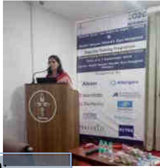
6 & 7 September 2019: "Standardizing Primary Eye Care Services" at Alakh Nayan Mandir Eye Hospital, Udaipur.