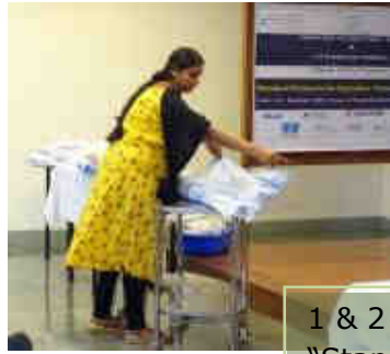
1 & 2 November 2019: "Standard Protocol for Operation Theatre Technicians" (SPOT) was conducted on. L V Prasad Eye Institute, Visakhapatnam