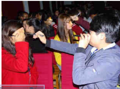
6 & 7 December 2019 : "Optical Dispensing" at Bansara Eye Care Centre, Shillong