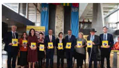
World Report launch at WHO

The World Health Organization launched its first World Report on Vision on 9 October 2019. The report is the cornerstone of IAPB's global advocacy strategy. It provides a critical moment to inform and persuade global leaders about the magnitude of vision loss globally to take concrete steps. The report offers clear proposals to