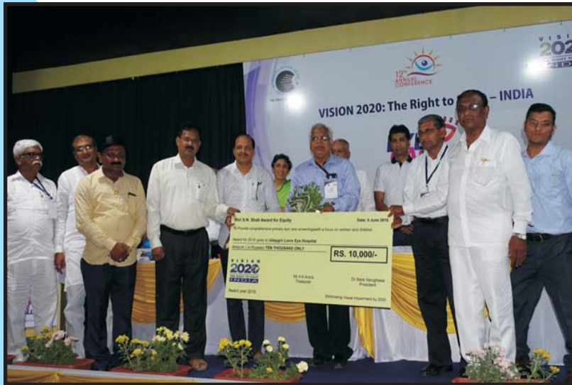
SN Shah award being presented