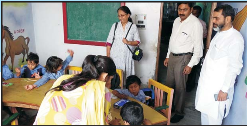
VISION 2020 INDIA at Kalyanam Karoti