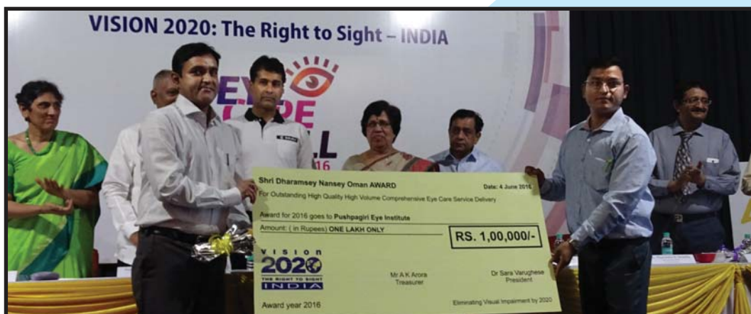
The Dharamsey Nansey award being presented.

Two awards instituted by VISION 2020 – INDIA were presented at the inaugural. Dharamsey Nansey Award was presented to Pushpagiri Vitero Retina Institute, Hyderabad and the SN Shah award to Udaygiri Lions Eye Hospital, Latur.