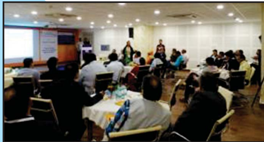
Workshop on Cost Management in progress

54 delegates from 17 organisations from 10 states participated in the workshop.