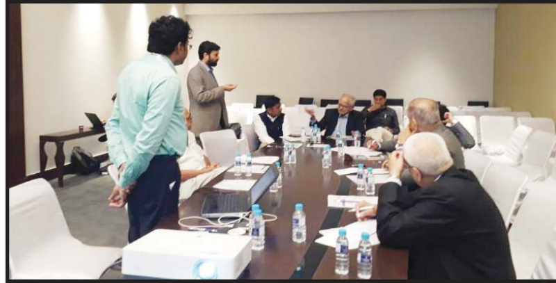
The 53rd Board meeting was held at Jaipur.