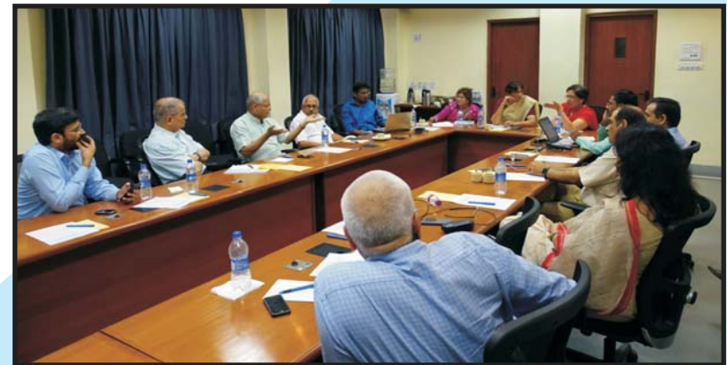
The 51st Board meeting was held in Hyderabad

52nd Board meeting of VISION 2020 – INDIA held in Delhi on 8 December 2016 at Delhi.