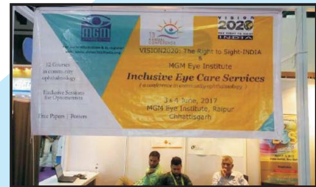
Stall at AIOS, Jaipur

VISION 2020 – INDIA participated in the All India Ophthalmology Conference at Jaipur. Our session was on 'Expanding paradigms of eye care: drawing in and reaching out'. NPCB official also made a presentation in this session.