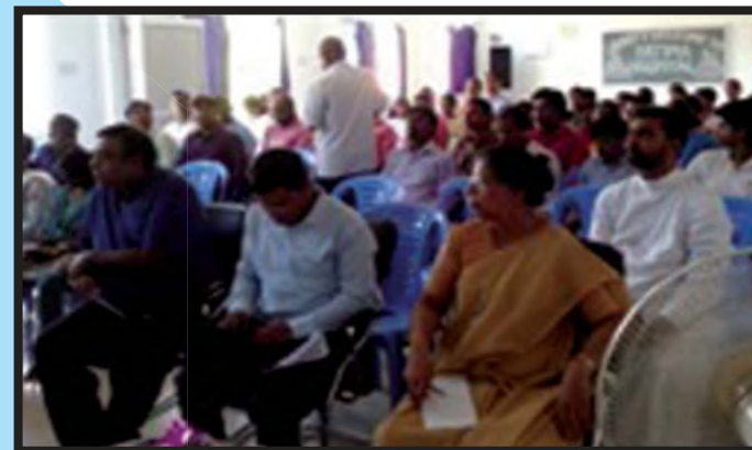
Strategic Plan workshop at Fatima Hospital

Fatima Hospital is a 125 bedded general hospital with 25 medical disciplines including community ophthalmology as