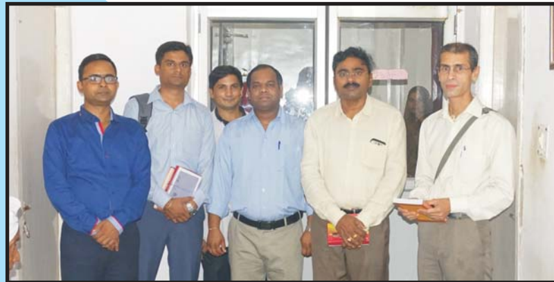
At Bhakti Vedanta Eye Hospital, Barsana.