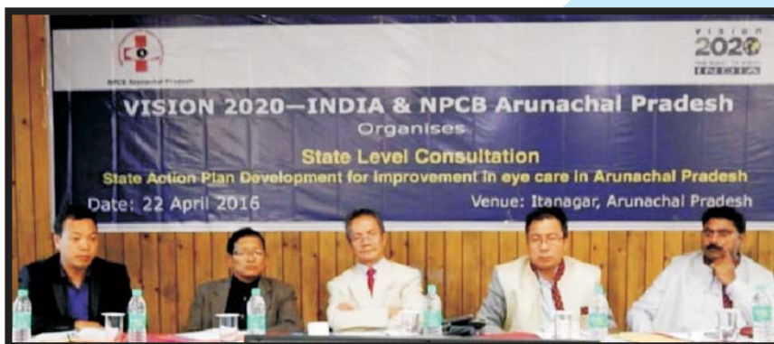
Meeting for developing Action Plan for the prevention of avoidable blindness and visual impairment in Arunachal Pradesh in progress at Itanagar

In 2016, VISION2020 - INDIA developed a state plan for Arunachal Pradesh. This was as per our strategic plan to strengthen the north eastern states towards ensuring equitable eye care.