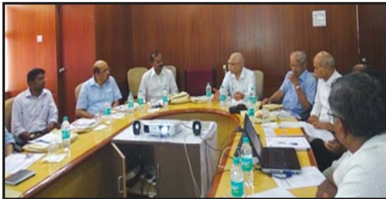
The 50th Board meeting was held in Pune.

The VISION 2020 – INDIA board meets 4 times in a year. Progress of the strategic plan that governs the road map towards achieving the 2020 goal is the main agenda for discussion.