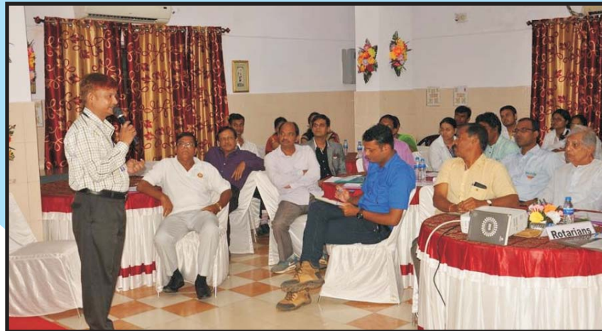
The east zone meeting in progress

A special session on 'Entry Level NABH Accreditation and Leadership' was also organised after the zonal meeting.