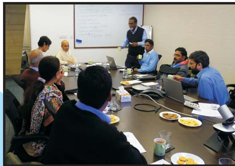
Brain storming for developing the strategic plan