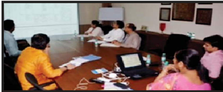
The Peer review in progress