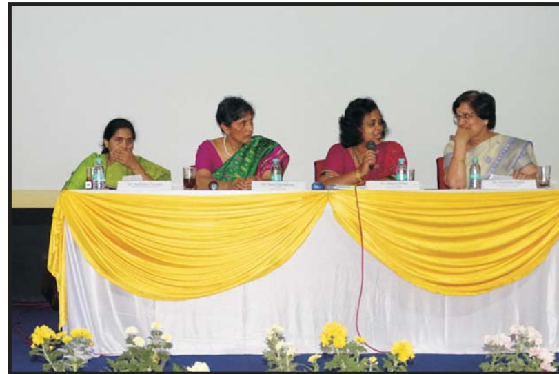
A special session was held with the Joint Secretary, head of NPCB at the conference.