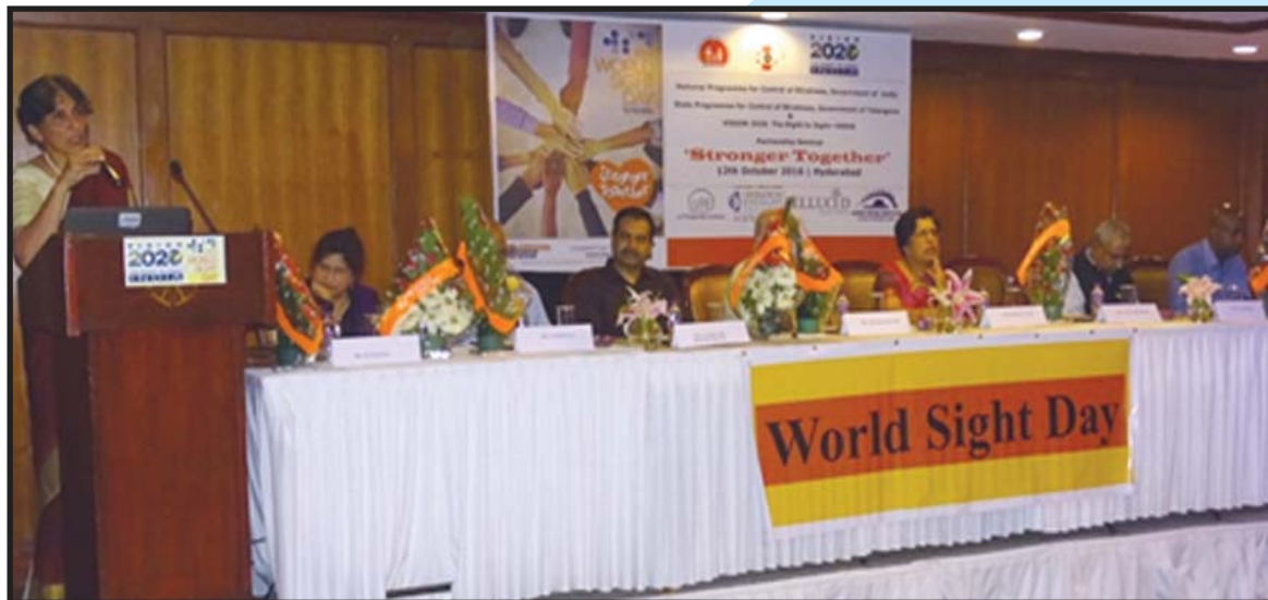
Stronger Together – a partnership seminar on the theme of the World Sight Day 2016

In addition, both in Delhi and Hyderabad, messages on prevention of avoidable blindness were aired through All India Radio FM channels (Gold and Rainbow) in Hindi in Delhi, and in Telugu in Hyderabad (Rainbow) as supported by NPCB/GoI.