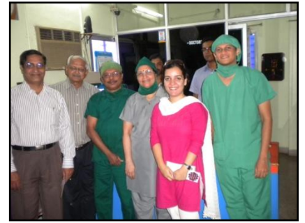
VASM Charitable Eye Hospital