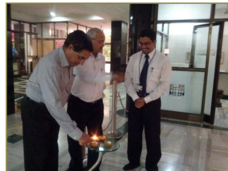
At KK Eye Institute, Pune