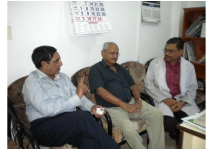
KG Eye Hospital, Coimbatore