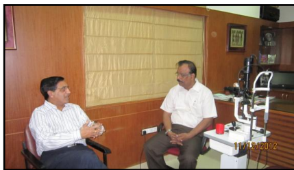
At Arasan Eye Hospital, Erode