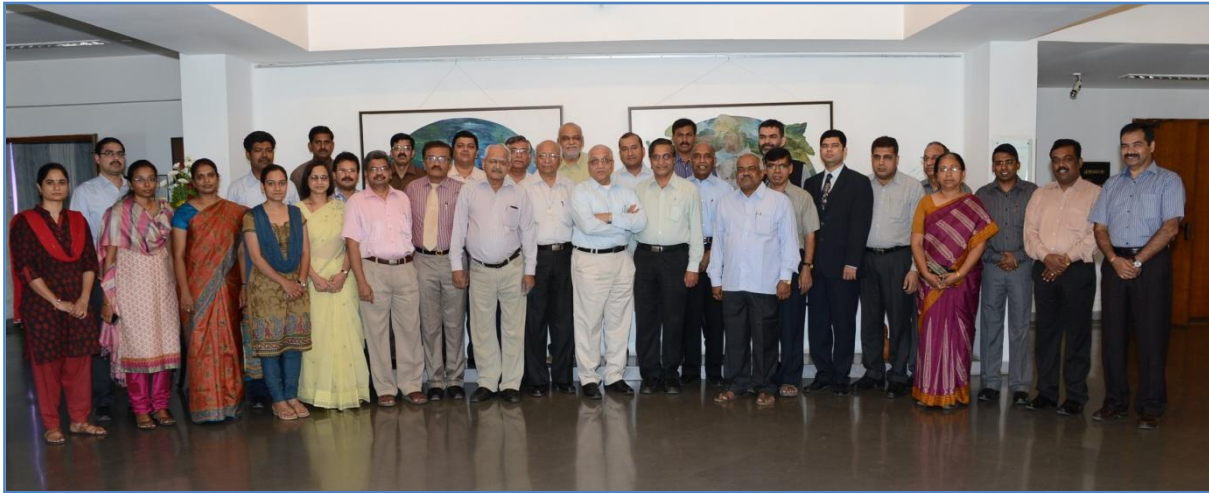
Participants at the 'Operations Management for Effective Eye Care' workshop

As a follow up of this workshop, a manual on this subject will be developed.