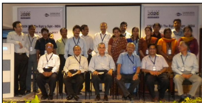
Participants of the south zone meeting of members from Karnataka & Tamil Nadu