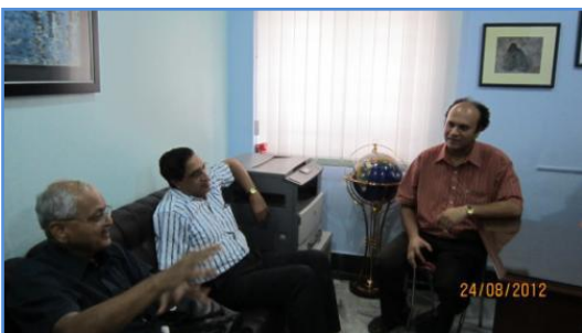
Susurat Eye Hospital, Kolkata