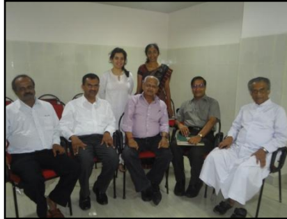
At Little Flower, Anganmally