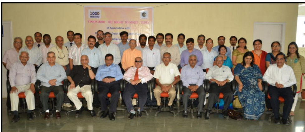
Participants at the Costing of Eye Care Services workshop

We would like to thank the management of HV Desai eye hospital for hosting the workshop and all participants who made valuable inputs for making the workshop a success.