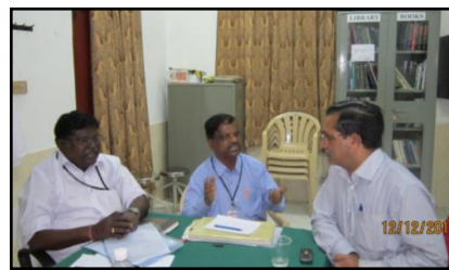
At PIMS, Pondyicherry