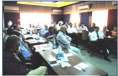
The 'Costing of Eye Care Services' workshop in progress

The costing workshop was an outcome of a growing concern among our members, INGOs that it was essential to work out a minimum cost for treating eye care diseases. Towards this effort, a significant workshop on 'Costing of eye care services' was held at HV Desai Eye Hospital, Pune, Maharashtra on 21st & 22 nd June, 2012. The workshop aimed at developing a minimum costing of common eye diseases that can be used as a standard tool while requesting the government, INGOs and other supporters while considering the minimum cost.