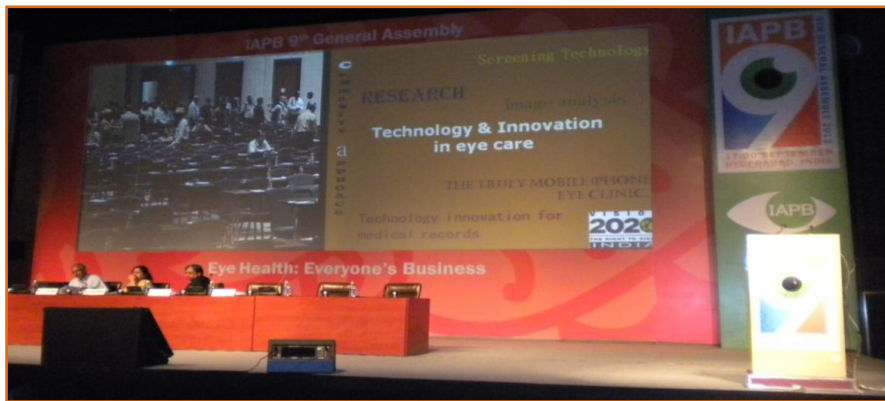
Technical Session at IAPB

A technical session, breakfast session and promotion stall: this was VISION 2020 – INDIA's participation at one of the most sought after global conference in eye care: the IAPB 9th GA held at Hyderabad from September 17 – 20, 2012.