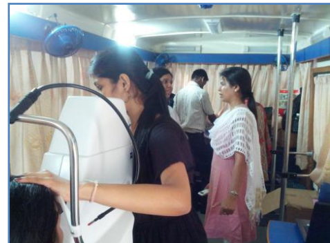
DR screening van at, KB Haji Bacholi Eye Hospital Mumbai