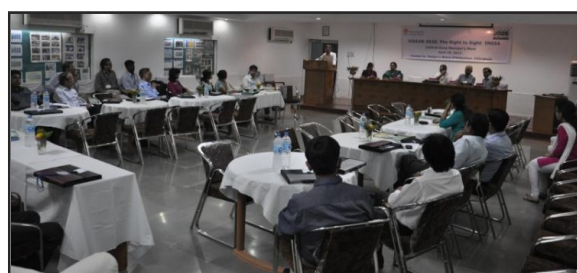
The central zone meeting in progress