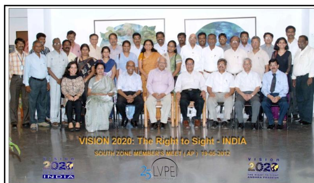
The south zone meeting of members from AP

The other two zonal meetings that were held were in central and east zone. The central zone meeting was held at Sri Sadguru Netra Chikitsalaya Chitrakoot and the east zone at Vivekananda Mission Ashram, Haldia, West Bengal.