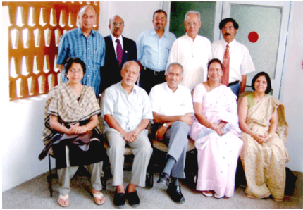
VISION 2020 INDIA - 5th Board Meeting 19th April 2005, New Delhi.